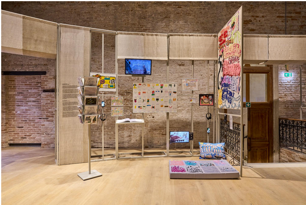
'Best Wishes' by Katya Buchatska, the Ukrainian Pavilion at Venice Biennale, 2024.