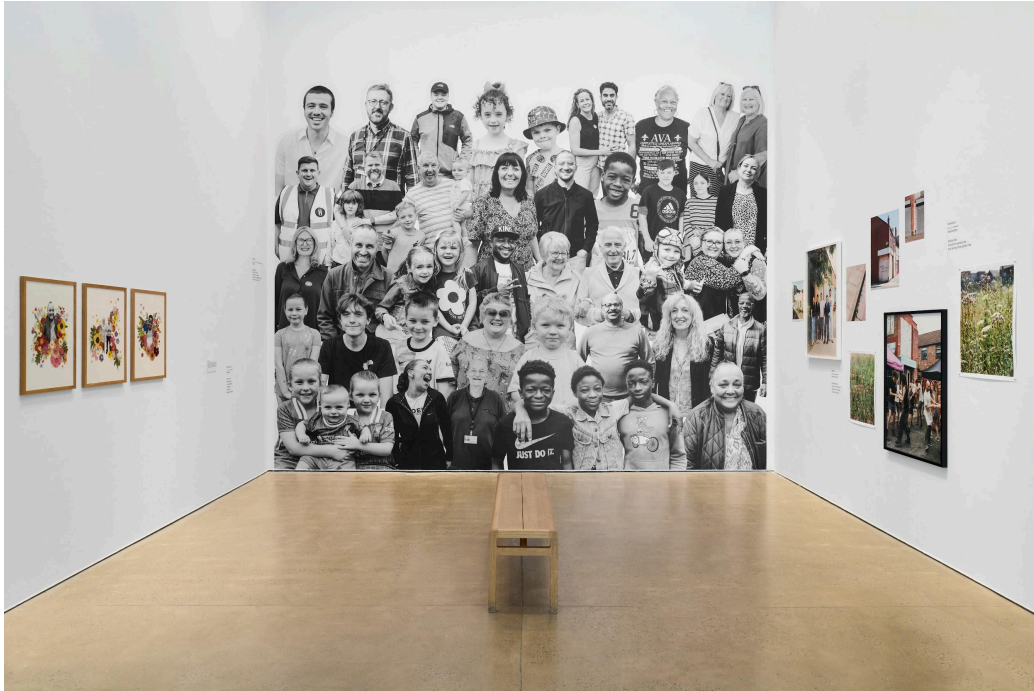
Artwork by Emma Case, The Flowers Still Grow , Open Eye Gallery 2024.