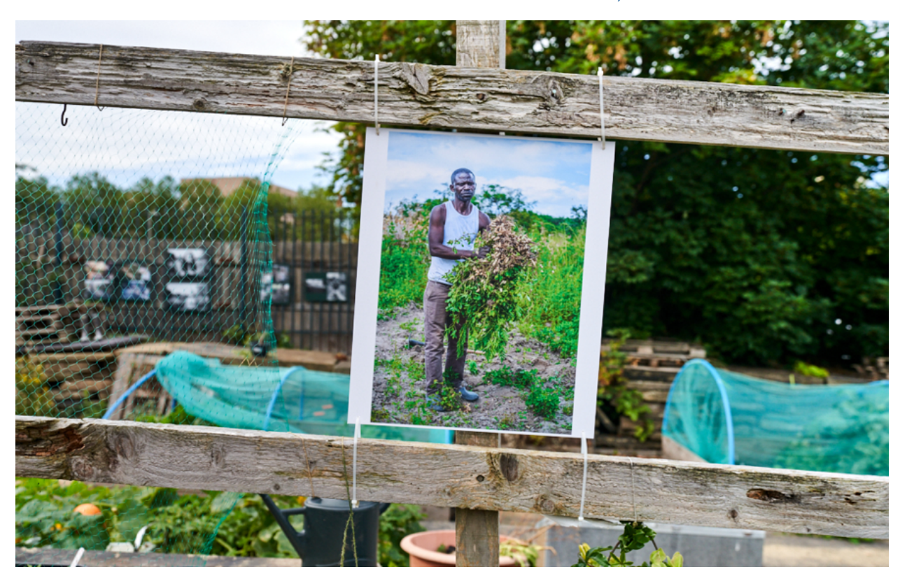
MWALULA by Hellen Songa