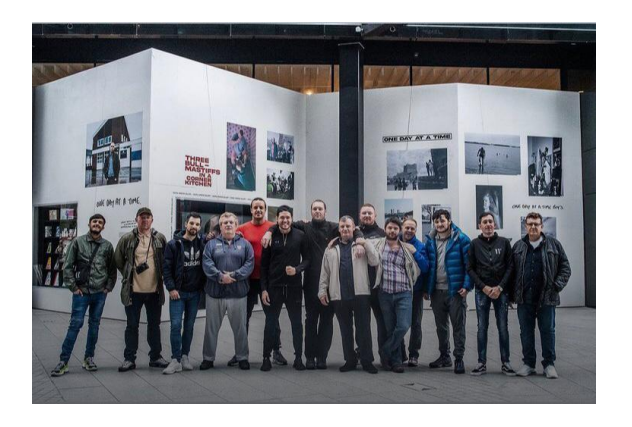
One Day At A Time Boys

We work with people to explore photography's unique ability to connect, to tell stories, to inquire, to reflect on humanity's past and present, and to celebrate its diversity and creativity.