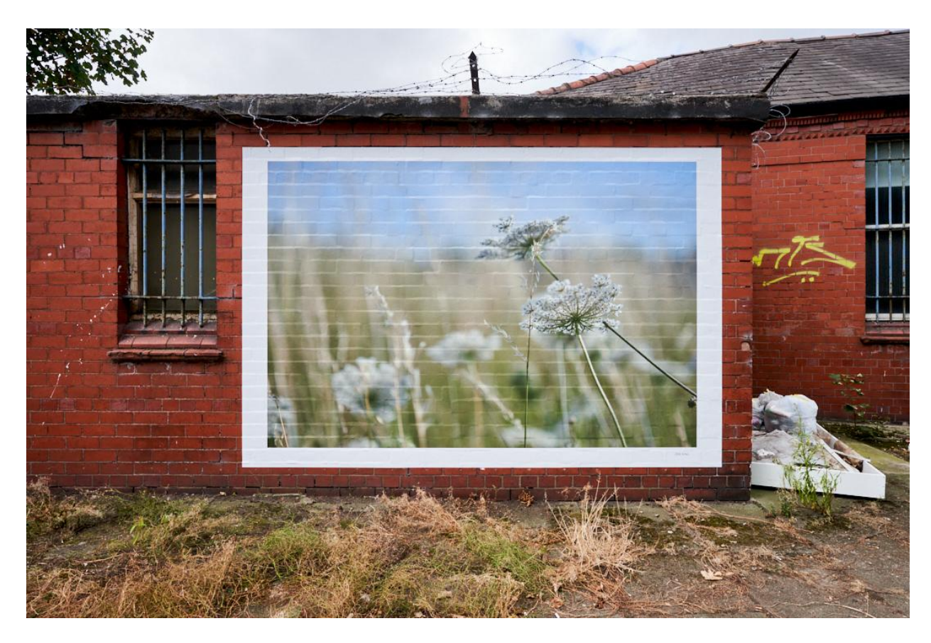
Clickmoor on Climate at My Clubmoor, Liverpool

At Open Eye Gallery we are committed to sustainable practices, working to reduce our impact on the environment. We have embedded monitoring and reporting on our carbon usage and updating our knowledge via staff training and active learning with climate focused groups.