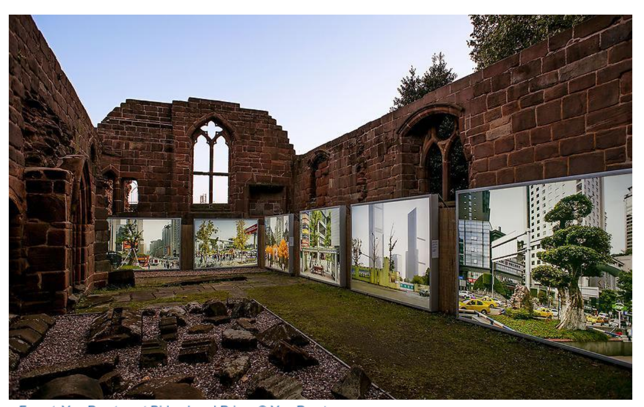
Forest, Yan Preston at Birkenhead Priory © Yan Preston

We believe photography is for everyone and can meaningfully inform our present and inspire positive futures.