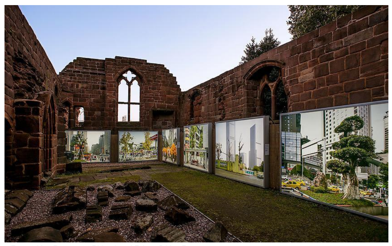
Forest, Yan Preston at Birkenhead Priory

We believe photography is for everyone and can meaningfully inform our present and inspire positive futures.