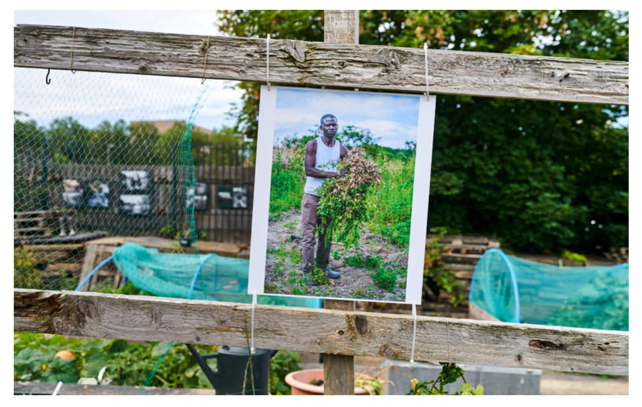
MWALULA by Hellen Songa