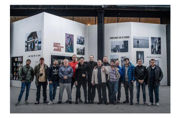
One Day At A Time Boys

We work with people to explore photography's unique ability to connect, to tell stories, to inquire, to reflect on humanity's past and present, and to celebrate its diversity and creativity.