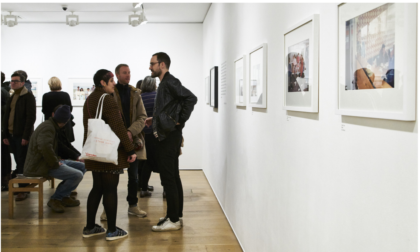
Open Eye Gallery, 2017.

The School co-ordinates a range of enterprise projects and initiatives that can benefit graduating students, in order to assist their career opportunities or routes into self-employment.