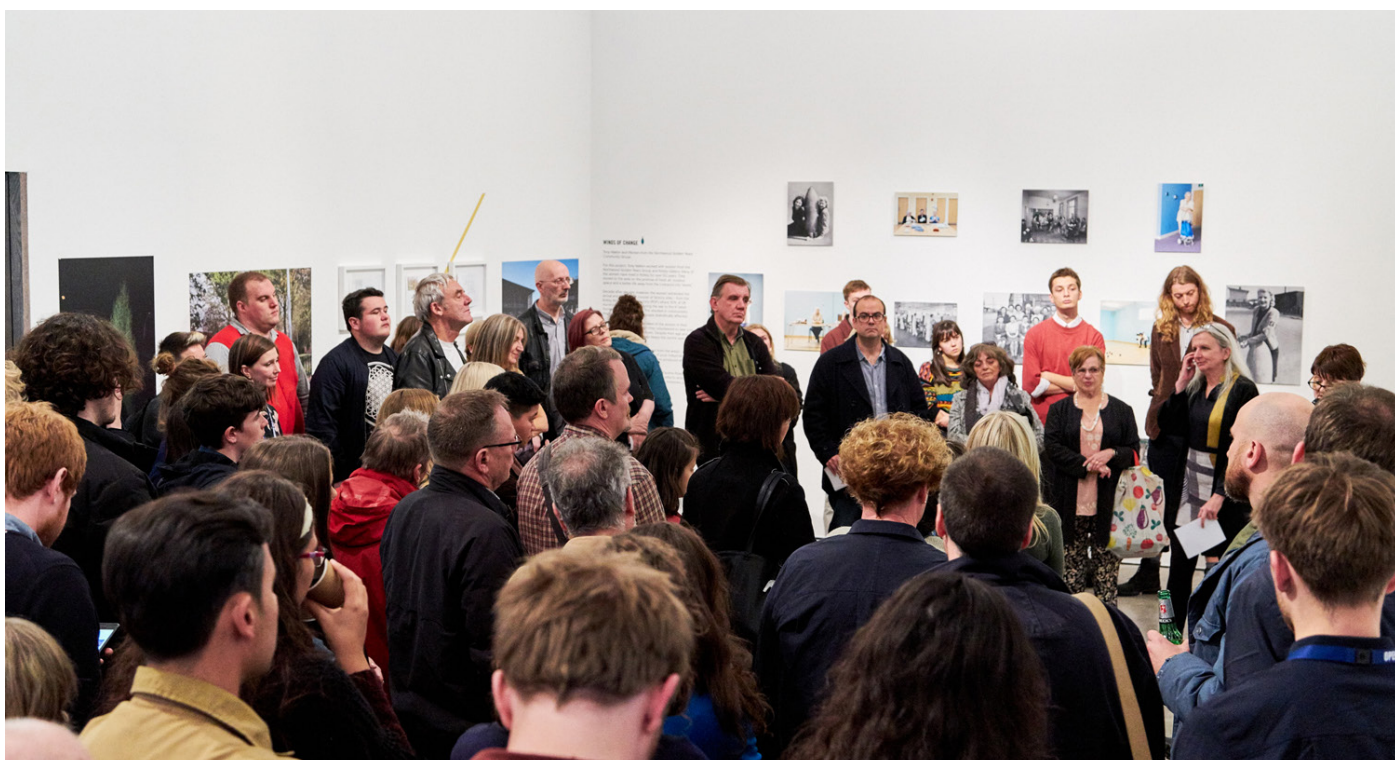
Open Eye Gallery, 2017.

The course is designed to enable students to graduate as professional artists, curators, producers and creative practitioners. It is open to both photography graduates and humanities or social science graduates with a strong photographic portfolio.