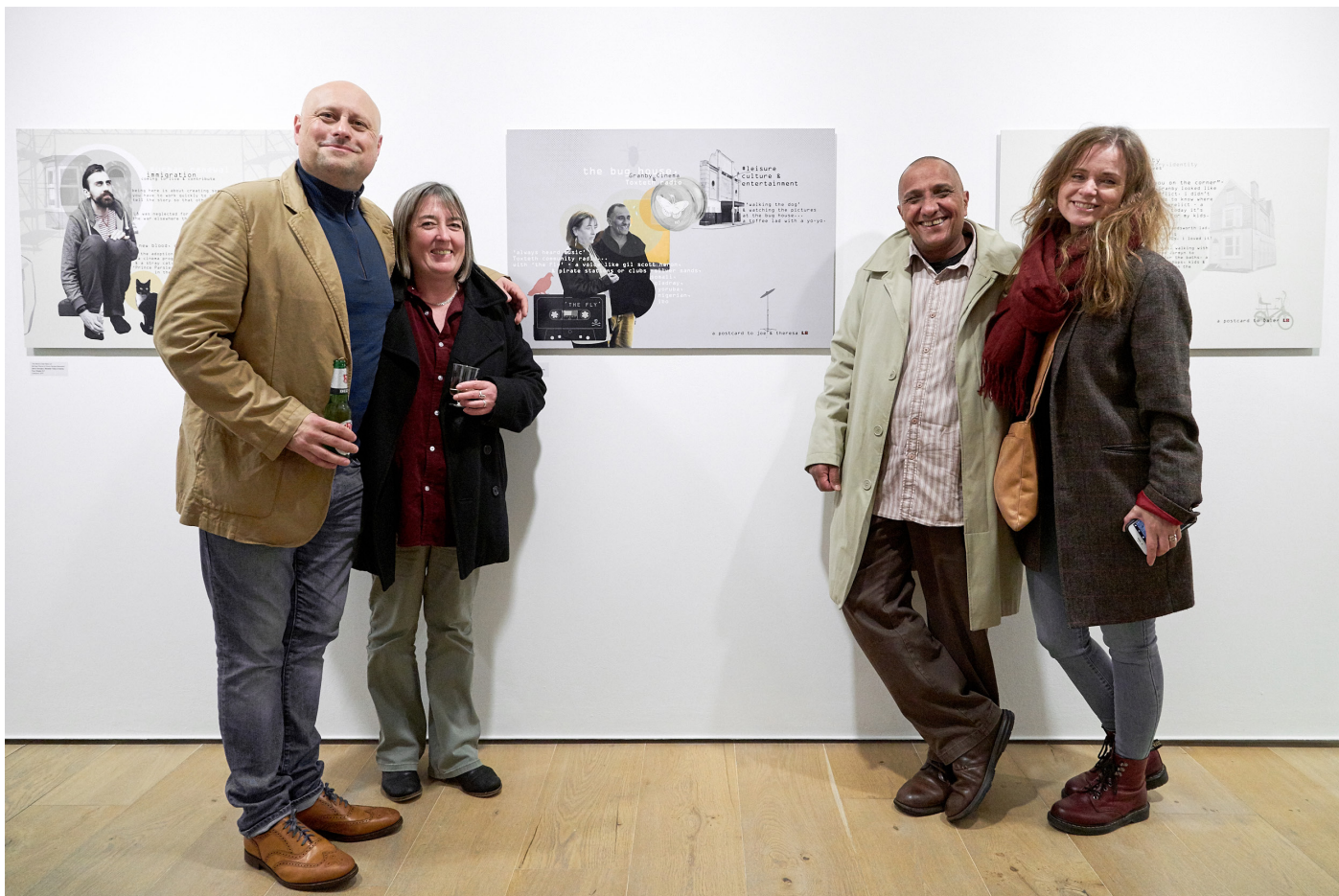
Open Eye Gallery, 2017.