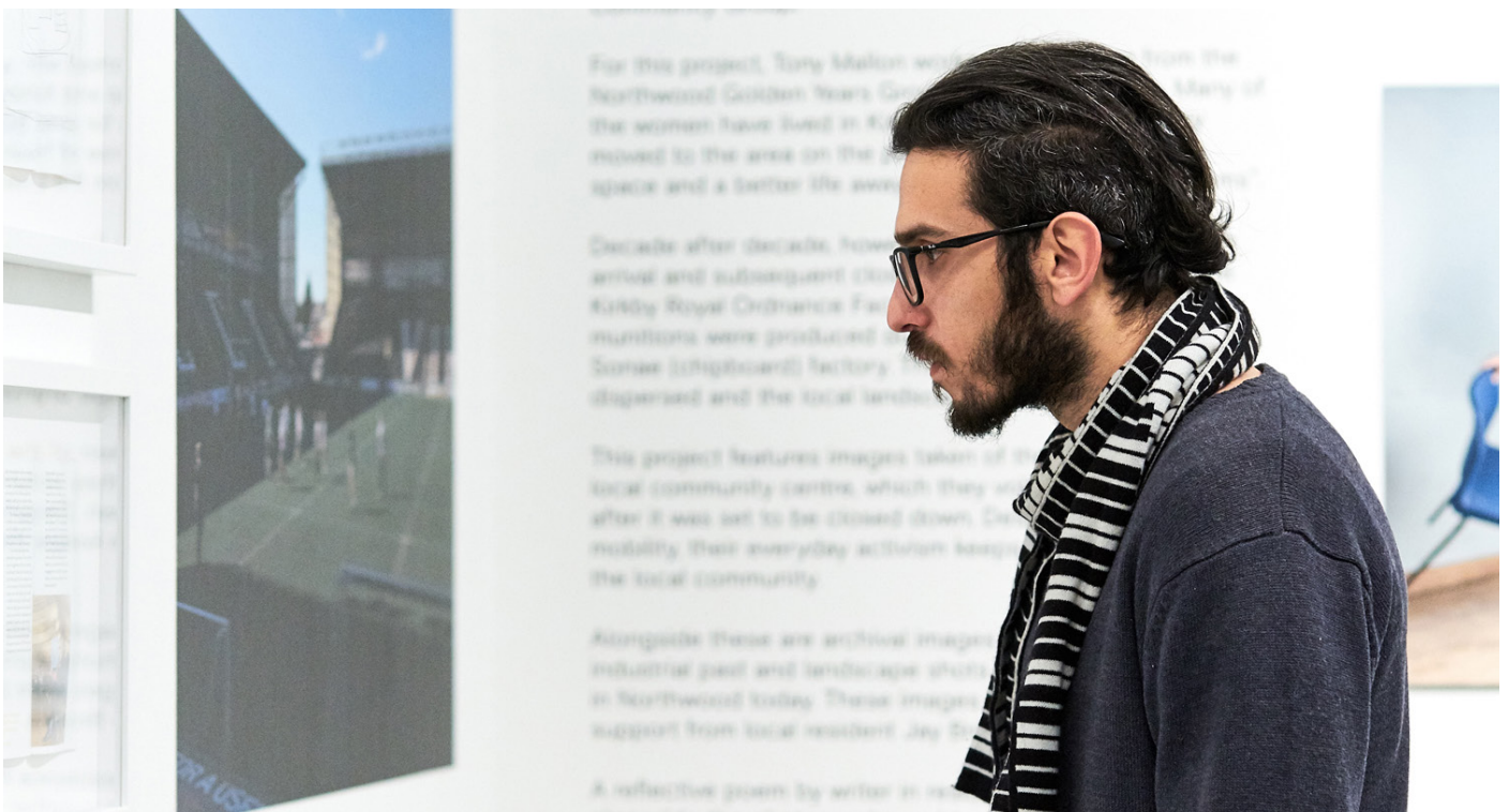
Open Eye Gallery, 2017.

Socially Engaged Photography Practice focuses on the process of building relationships with communities. The photographers practice is developed through this process - they bring their creative expertise together with the life experience of communities to co-author culture. Students on the programme will have opportunities to develop their practice, contextual and critical framework with the academic rigor of the university and Open Eye Gallery's experience of both facilitating professional programme with communities, and of extending the profile of the practice beyond the local.