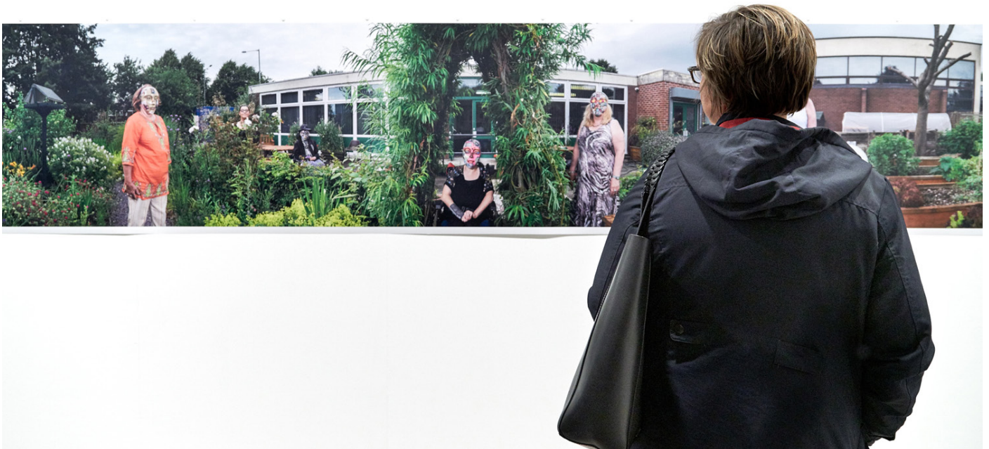
Open Eye Gallery, 2017.