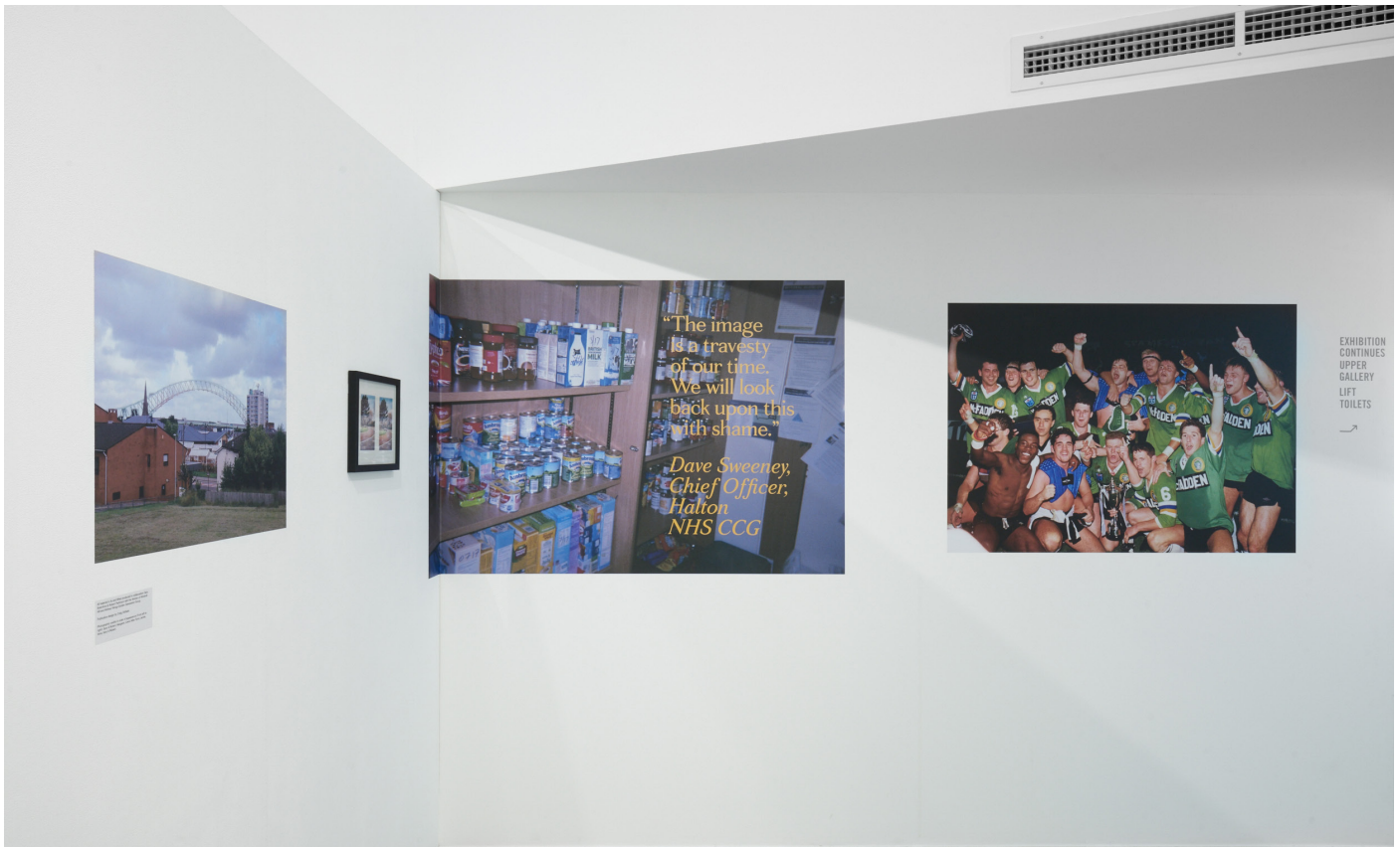
Open Eye Gallery, 2017.