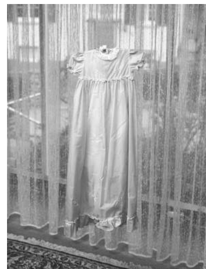
They Were My Landscape © Phoebe Kiely, 2015/16 I Used To Think You Were Normal © Sam Hutchinson, 2015/16 The Unforgetting © Peter Watkins 2015